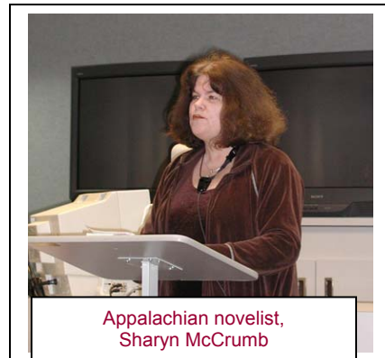
Appalachian novelist, Sharyn McCrumb