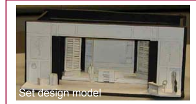
Set design model

In a survey of participating schools, the Barter class met the student expectations and they looked forward to participating in future events.