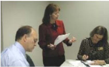
SVETN's PD Initiative Advisory Council